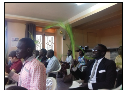
PALM SUNDAY SERVICE